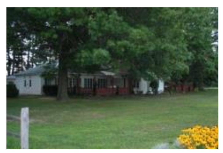
Saturday at Bill Stanton Park, Reunion Location