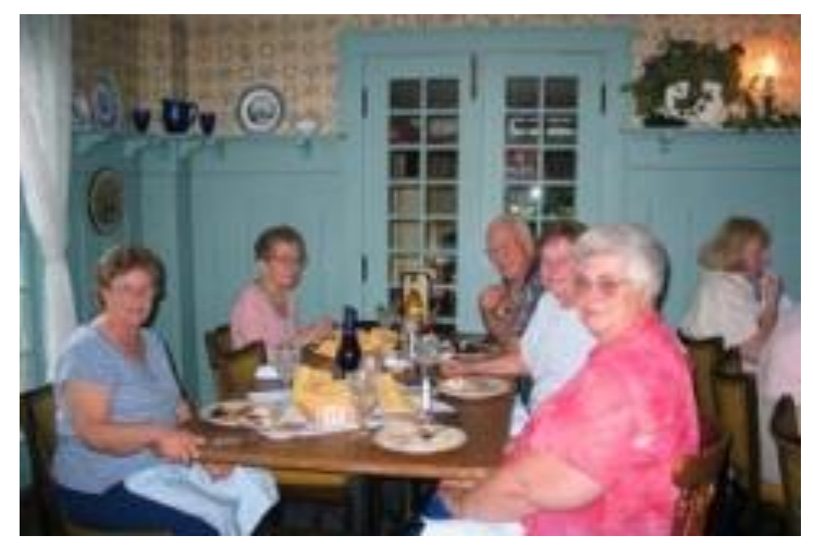
Friday Night at the Old Tavern 3