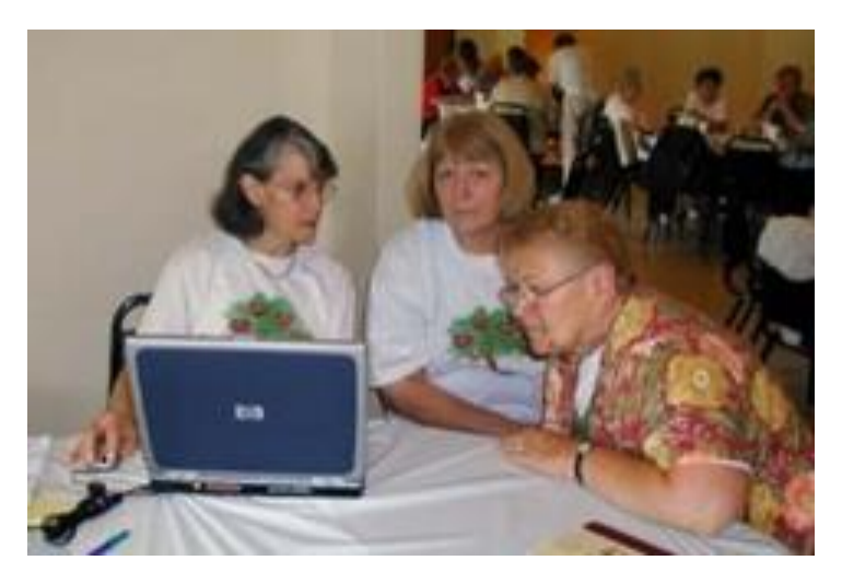
Family Information - Interesting Stuff