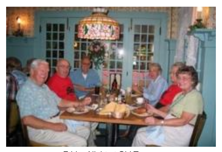
Friday Night at Old Tavern