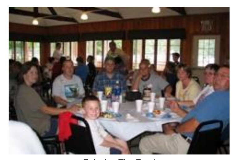
Enjoying The Food