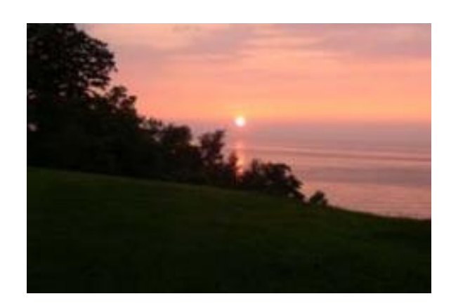
Until Next Time, Many Beautiful Sunsets.....