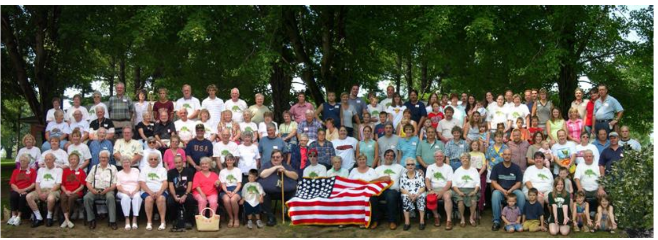
All one big happy family thanks to the talents of Wilma Vermilyer who skillfully combined the two groups, removed duplicates and added some of those attending that missed the picture taking — Thanks Wilma.