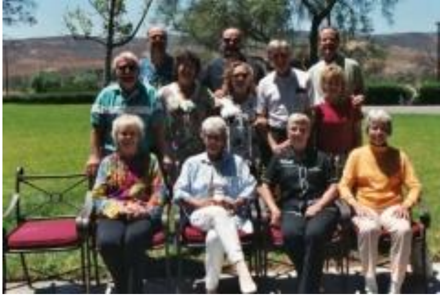
Seven Siblings and Spouses