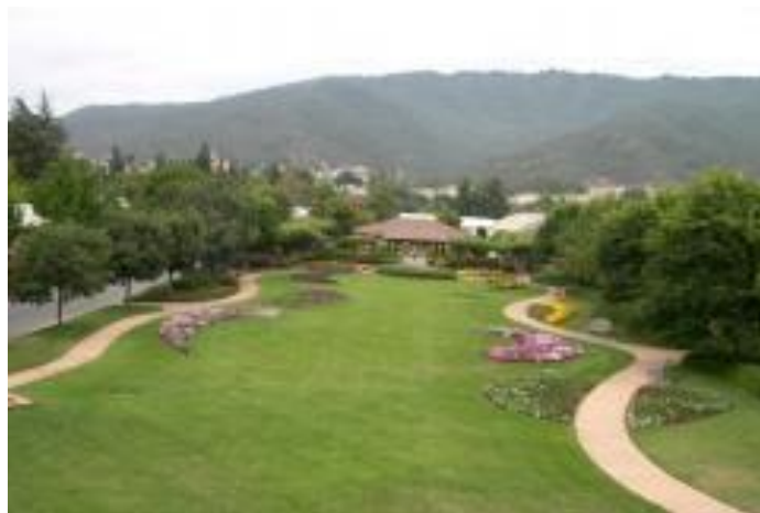
Garden at Goldsmith