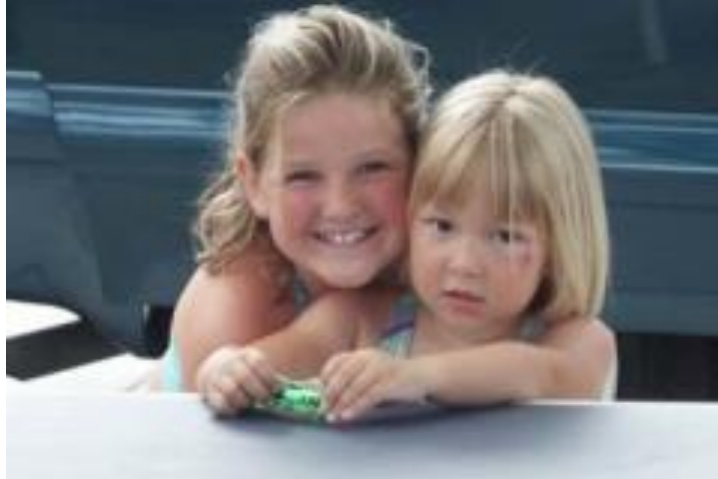
More Pretty Girls