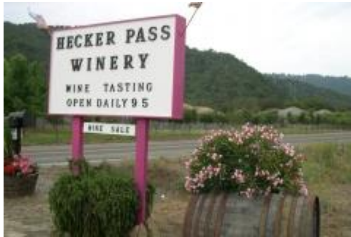
Winery at Gilroy