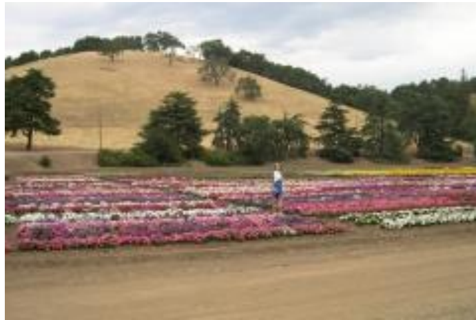
Sandra enjoys a Field of Flowers