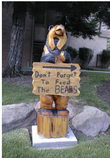
Don't forget to feed the Bears