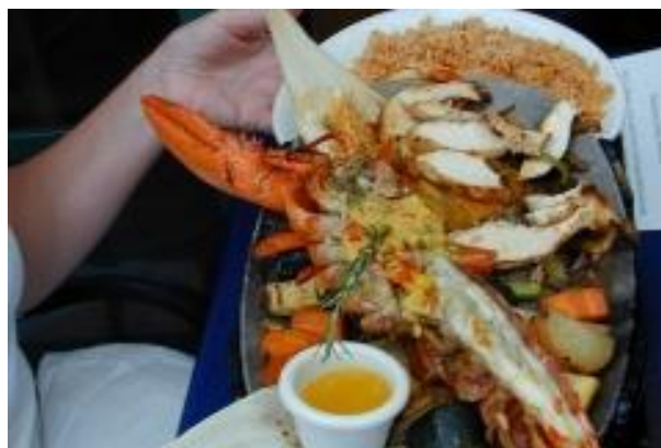
Delicious Eats at Chevys