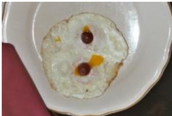
The Grape The Egg Revisited

A wonderful time was had, and Gary says it's time to turn these reunions over to the next generation!!!!