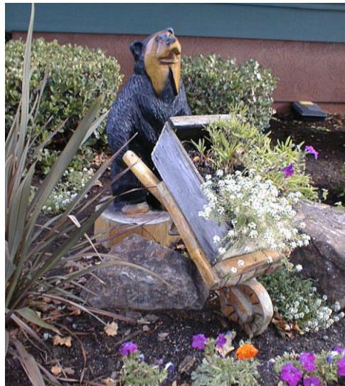
Bear at Forest Park Inn