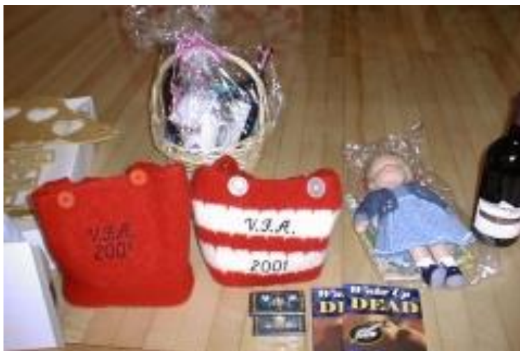
2001 Raffle items 2