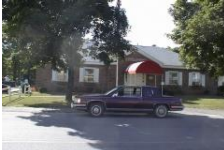
Polish American Club