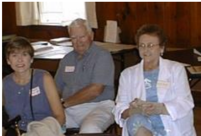
Some Folks from Pennsylvania