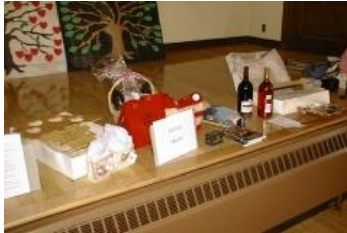
Raffle Items 6