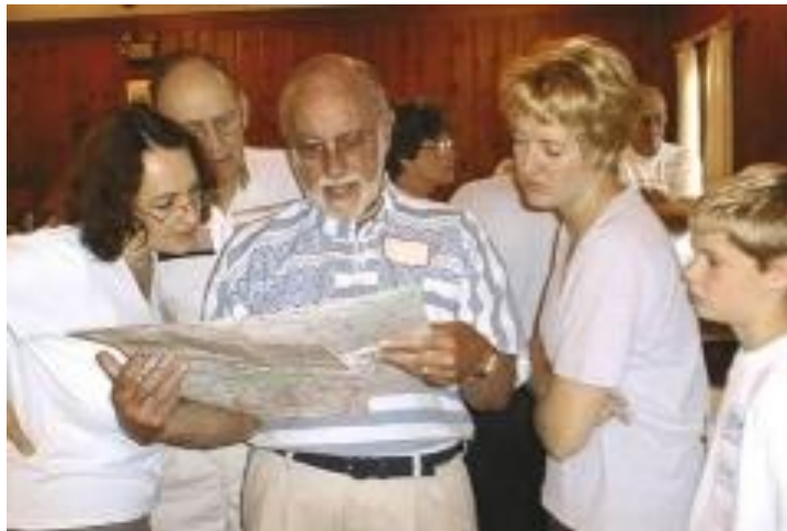
Where is Vermille with Dyck Vermilye