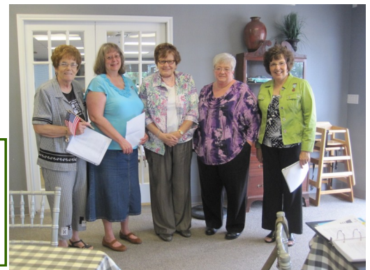
Oath of Membership for new members: