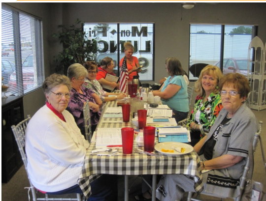
April 2011 Meeting at the Division Street Diner

Bring your Ritual and items for Veterans