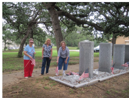
Memorial Day through July 4th