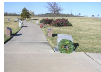
“Memorial Path,” D-FW National Cemetery