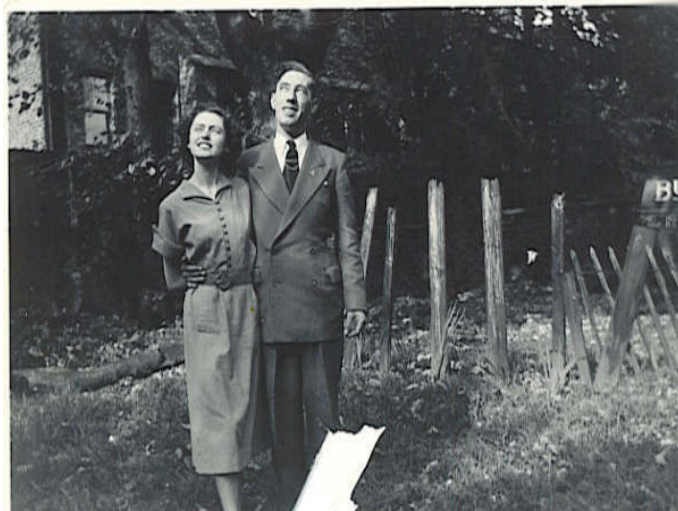
my grandparents engagement photo