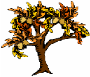
THE FAMILY TREE