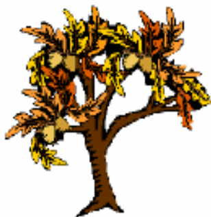
THE FAMILY TREE