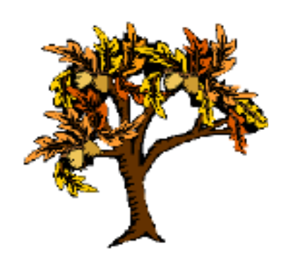
THE FAMILY TREE