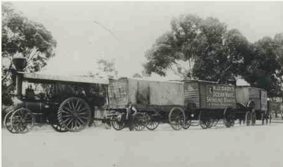
Circus Road Train at Willunga c. 1893

Read the story of our cover picture on page 10