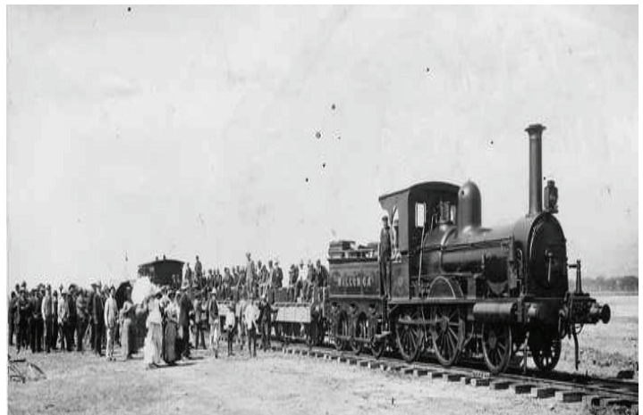
Train on the Willunga line at the opening of the line in 1915. The line officially closed in 1954.

Tuni —located at the present day Victor Harbor Road