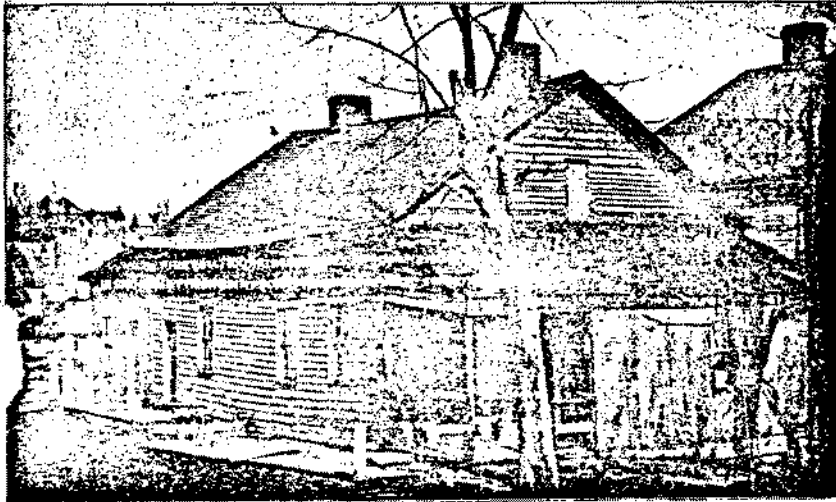
Where Bishop Simpson Preached His First Sermon, in Cadiz