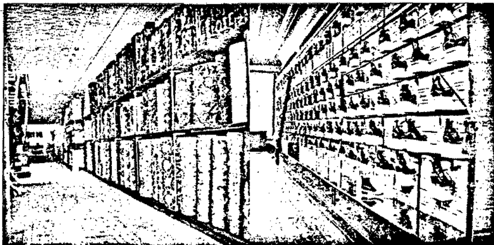
Section of Carpet Department