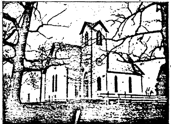
Dickinson M. E. Church, O. at Church in the State. Organized 1804