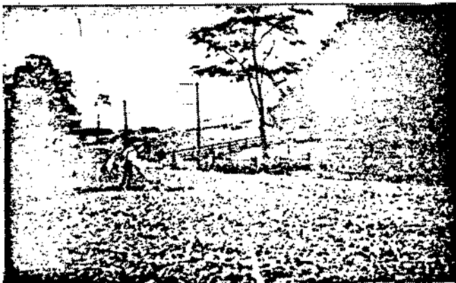
Section of Blair Pike, near Infirmary