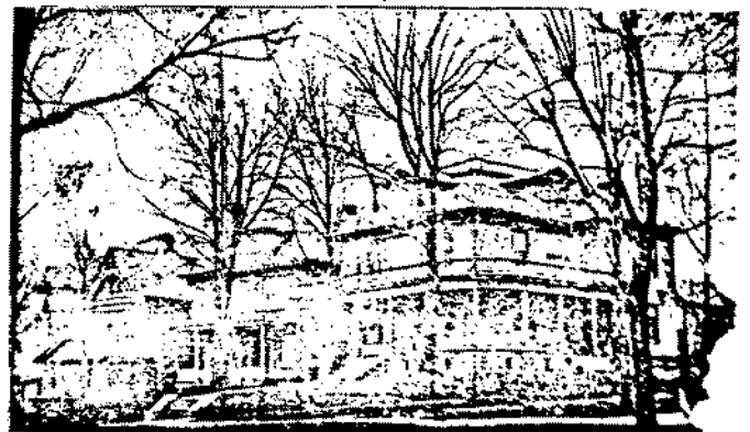
Top of Gimlet Hill, Cadiz

Call or write for prices. PRICES RIGHT. SERVICE PROMPT. Work GUARANTEED to be the BEST 213 Market Street, CADIZ, OHIO.