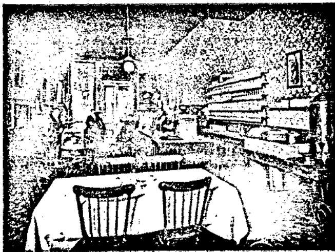
Interior of the Host Bros. Restaurant