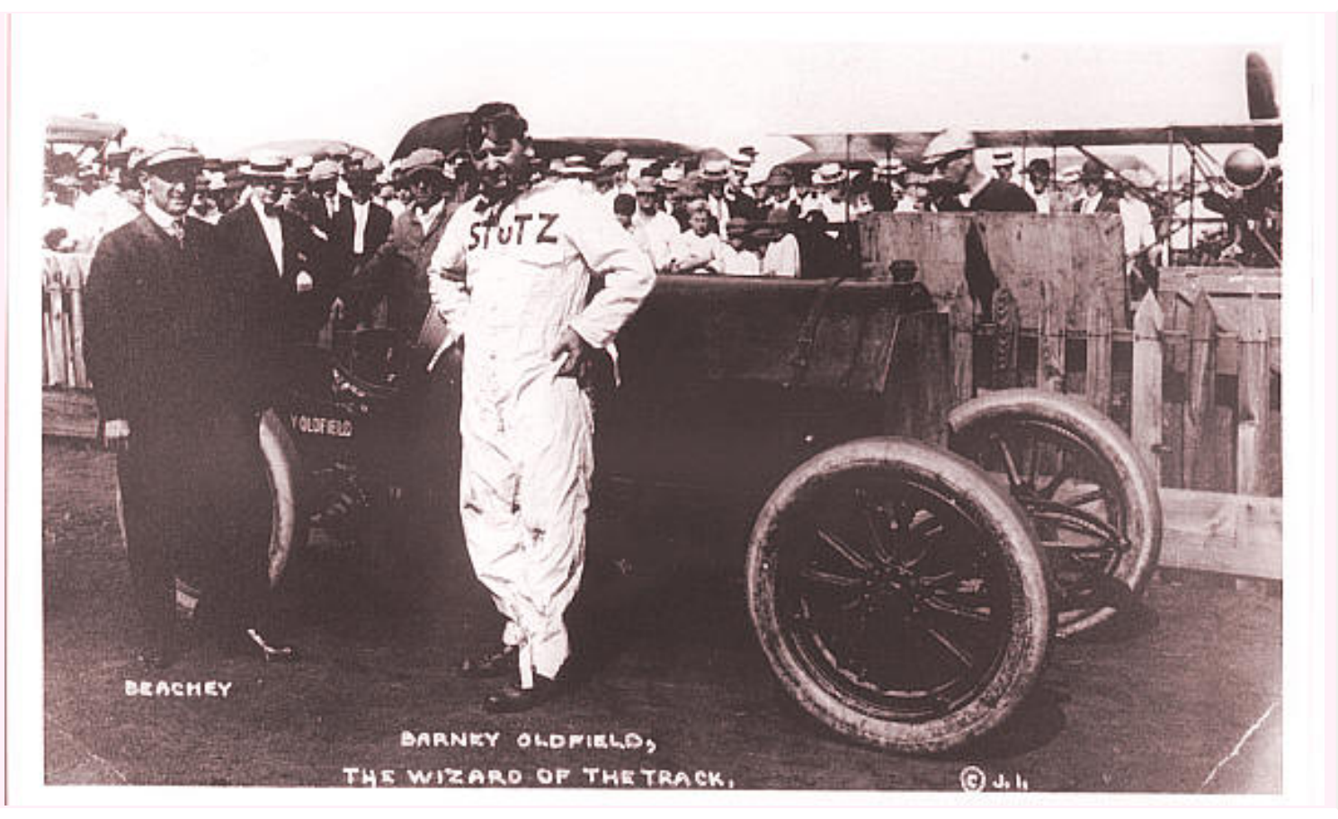
Barney Oldfield, "The Wizard of The Track"

This portrait was made when he was still interested in bicycle racing