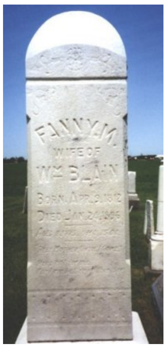
(south side of stone):