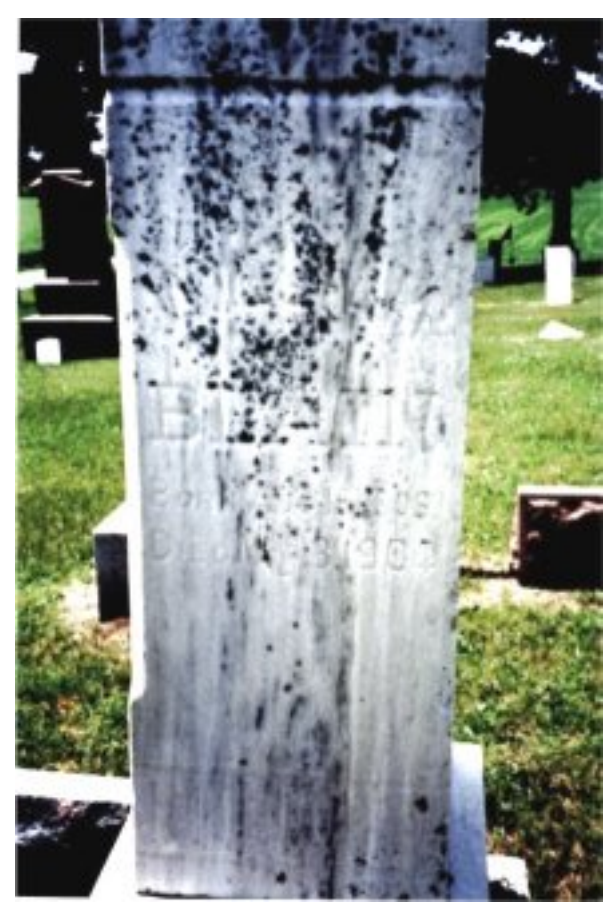
(north side of stone):