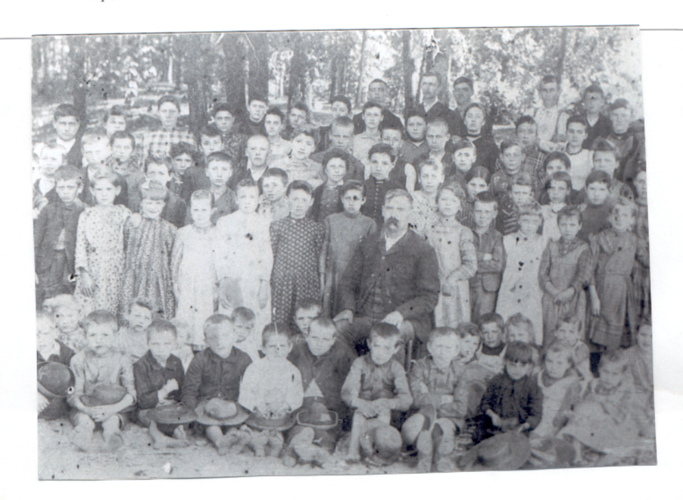
I don't have too much information on this picture except that it has a Concordia College time line.