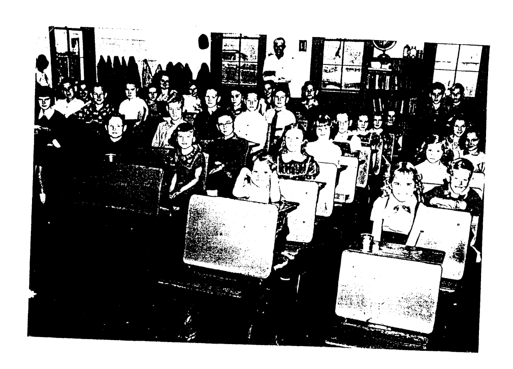
1952 and 1953 Class Picture (taken from a Xerox copy in Lettie Burris's notebook)