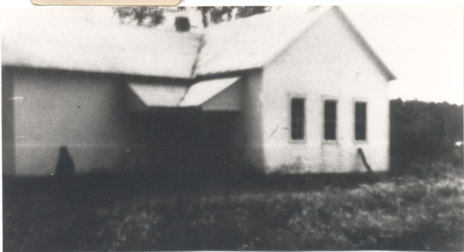
Front view of the Buckhorn school closed in 1965