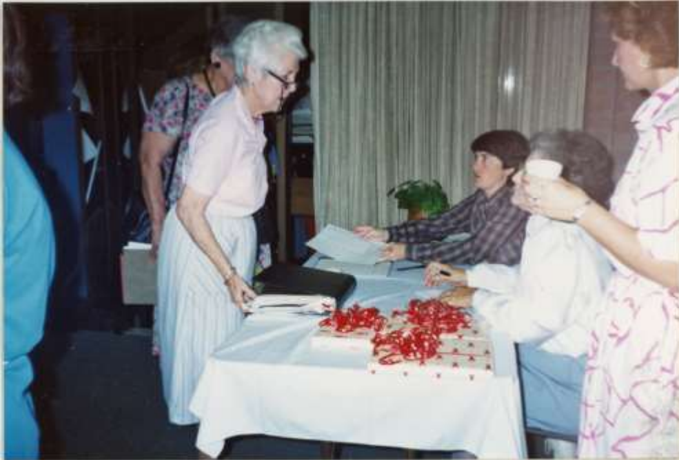
Registration for the seminar at the Lafayette Parish Library