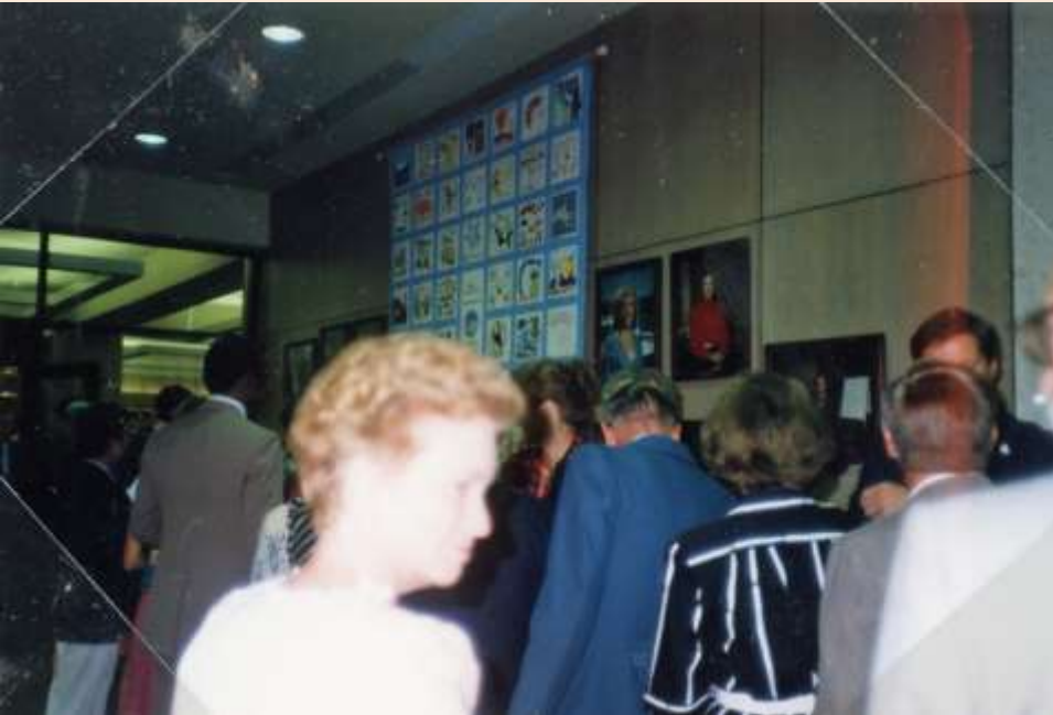
Another look into the Archives