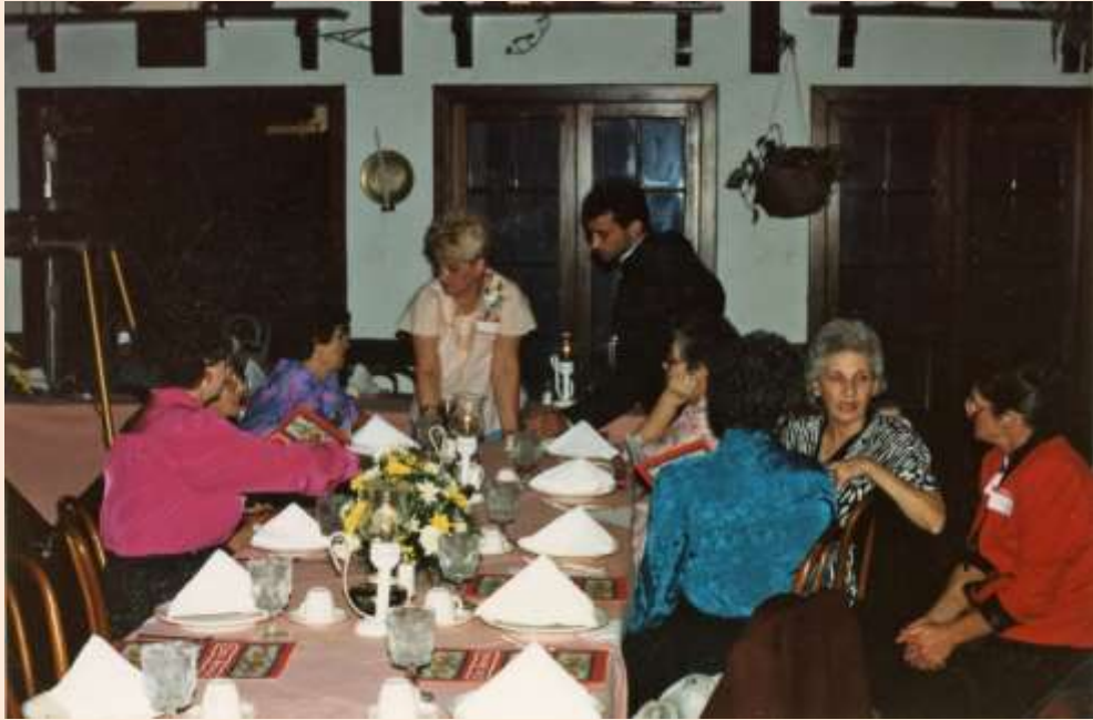
Time to order