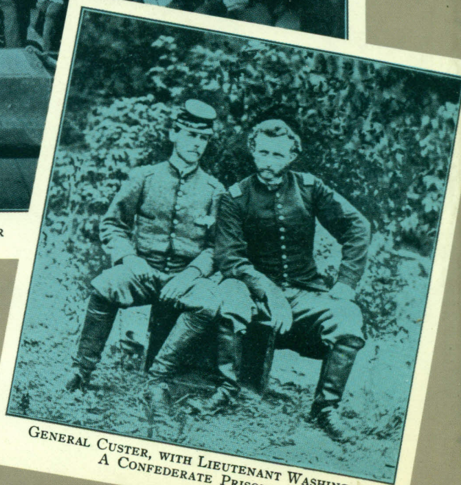
GENERAL CUSTER, WITH LIEUTENANT WASHINGTON, A CONFEDERATE PRISONER.