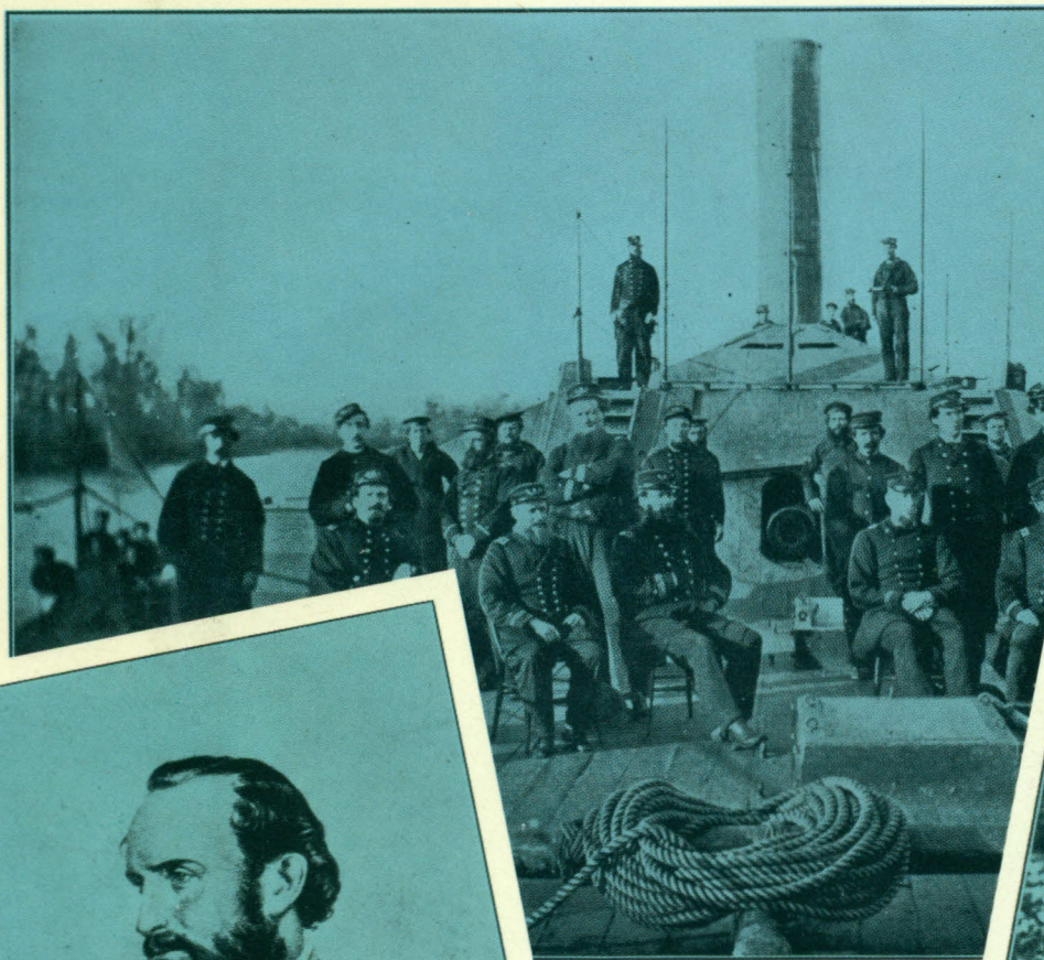
OFFICERS ON DECK OF MONITOR