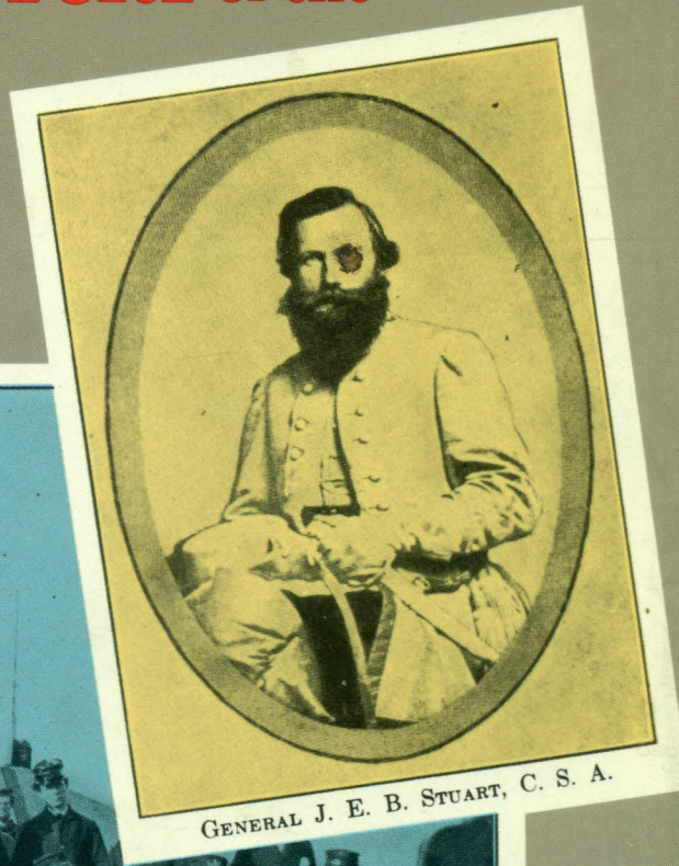
GENERAL J. E. B. STUART, C. S. A.