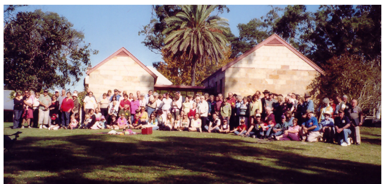
Grono Family Reunion 2007 Group Photo

Thank you to all who attended the reunion on Sunday, 6<sup>th</sup> May 2007 at Ebenezer Uniting Church; especially those who travelled long distances to be there!