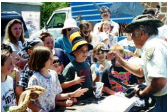
Children learn about snakes at an exhibit at the annual Springville Dairy Festival. There are many dairy farms in the Springville area.