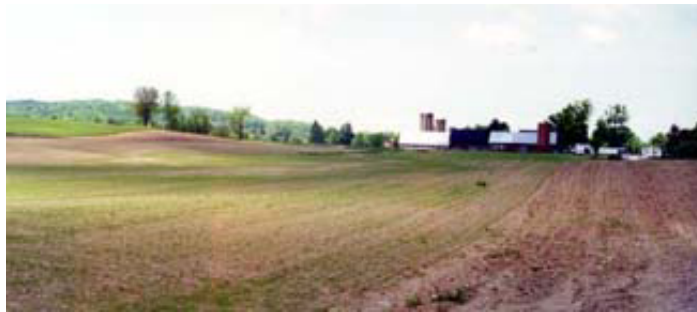
Farmland near Springville.

Springville is a small village in southwestern New York State, about 30 miles south of Buffalo. About 4,000 people live in Springville. It also serves as the commercial center for the surrounding rural farming and residential areas. In the late 1800s, many families emigrated from Wiesental, Germany and settled on the rich farmland and rolling hills around Springville, which somewhat resemble the landscape near Wiesental.