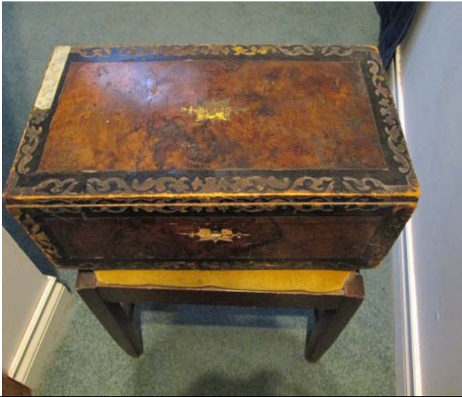
JRH - 02