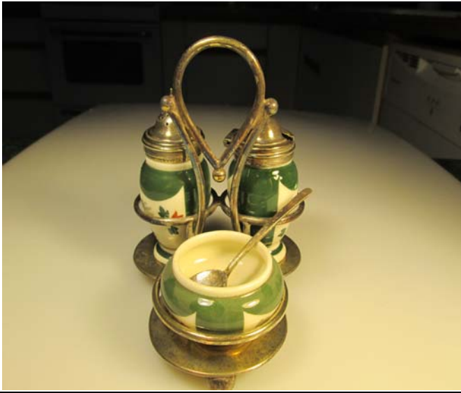
FMD - 01