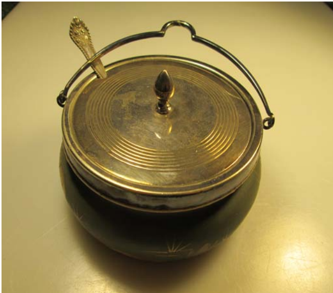
LPH - 01