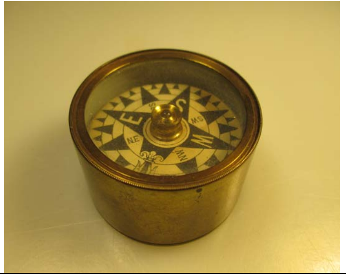
JRH - 01