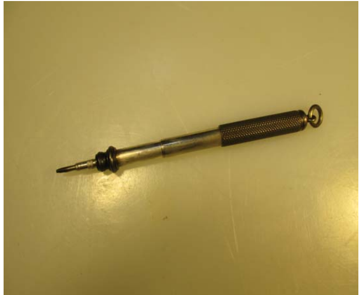
WHK - 04