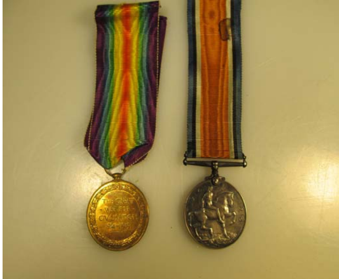
WHK - 01