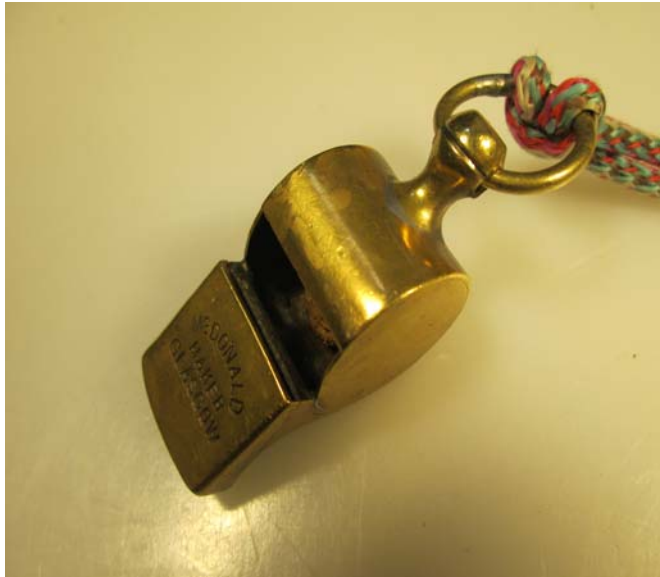
WHK - 03