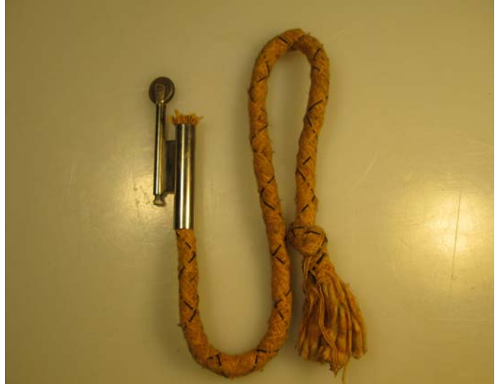
WHK - 02