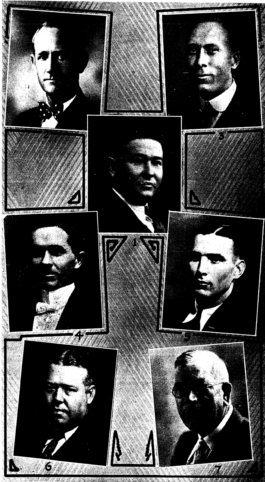
PAGE OF PROFESSIONAL MEN See legend on page 216.