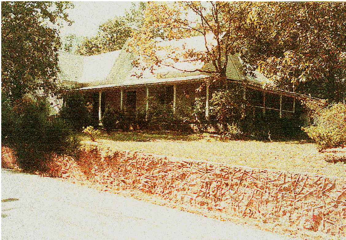
The Grant Family Home in Alto