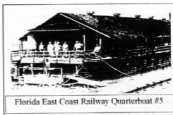
Florida East Coast Railway Quarterboat #5

Vincent N Ridgely was supervising the construction of piers for the Long Key viaduct. It was the second longest span on the overseas railroad. There are 222 arches in this 5.7-mile long bridge. He barely escaped with his life when a major hurricane struck the Florida Keys in 1906. The hurricane struck in full force on 18 October 1906. A barge with a frame house built onto it broke loose from its mooring. It was the living quarters for 175 construction workers. A high wave smashed the quarterboat into pieces. More than 100 persons were lost and drowned. Passing ships in the next few days, were able to rescue about 72 survivors who were found floating on pieces of the quarterboat. Some survivors were brought to Key West, and others to various ports along the East Coast. Some survivors were taken as far away as England. Perhaps because the captains of those ships did not want to reverse their course and go back to US ports!