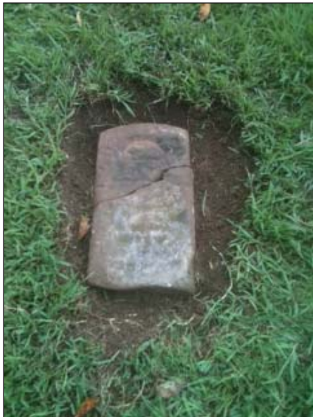
Another grave marker found hidden under the grass and dirt.