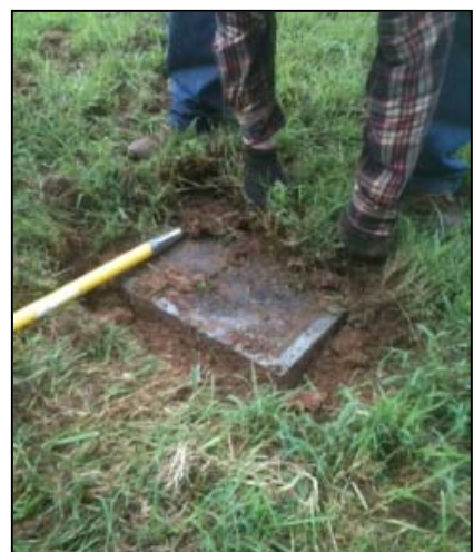
Clearing the dirt and grass from another fallen stone.