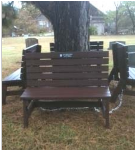
The benches built by Jerri Bravo and placed under the large tree in the cemetery.