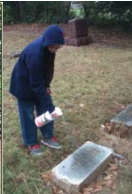
Spraying the stones with D/2.

Please contact the BCCPG if you know of a cemetery in Benton County that needs help. The BCCPG also maintains a list of cemeteries that still need to be adopted so please consider volunteering to help with one located near you. Email arbccpg@aol.com .