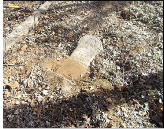
An old grave stone uncovered.

Clearing the brush, trees and vines was a major part of the cleanup. The next challenge will be finding a volunteer to help maintain this cemetery that is a part of Benton County's earliest history.