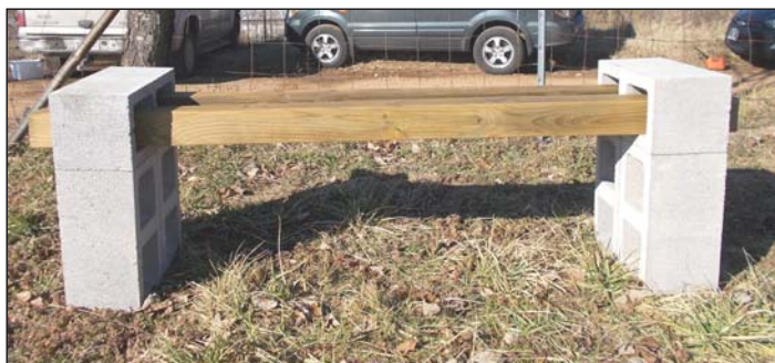
A Welcome Bench

Riley made sure that he had enough people to paint the fence and posts, weed eat the heavy grass growth, remove old rotted stumps from the cemetery by hand, and carry all the dead debris in the cemetery to a location outside in the field where the landowner requested so it would not be in the cemetery. Riley also included plans for a rustic bench to be set up inside of the gate to the cemetery.