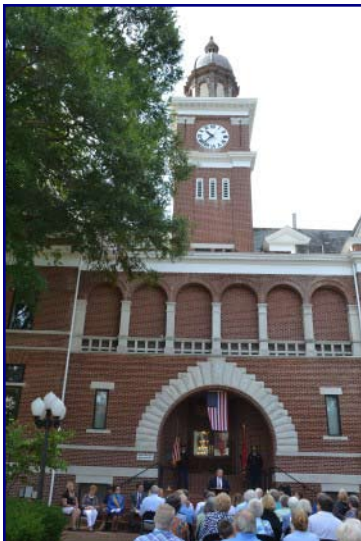
RECEPTION INSIDE THE COURTHOUSE