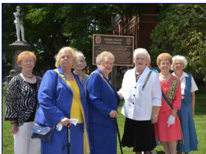
MEMBERS OF THE CAPTAIN CHARLES BARHAM CHAPTER