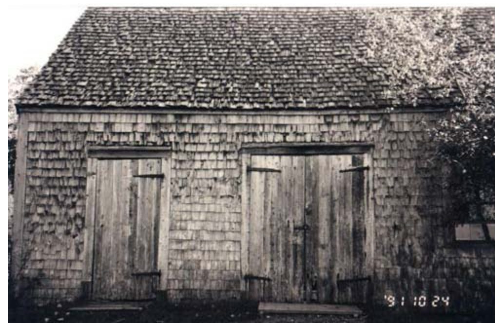
8) The blacksmith shop reconstructed at Grand-Pré in 1967 (photo taken in 1991)