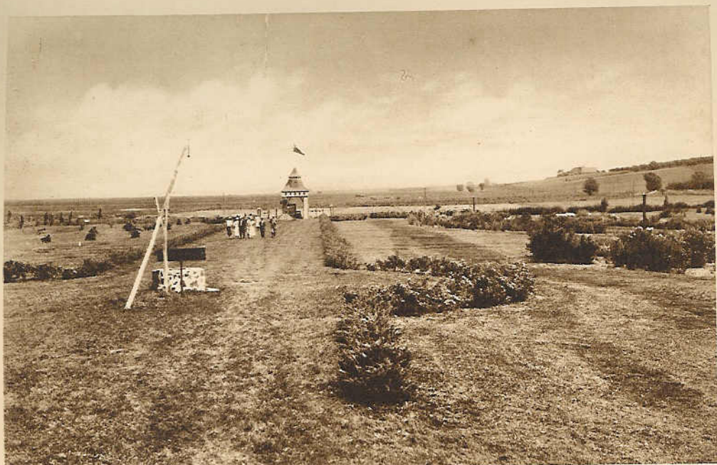
IN MEMORIAL PARK, GRAND PRE, N.S.

FARTHER DOWN, ON THE SLOPE OF THE HILL, WAS THE WELL WITH ITS MOSS GROWN BUCKET, FASTENED WITH IRON AND NEAR IT A TROUGH FOR THE HORSES.