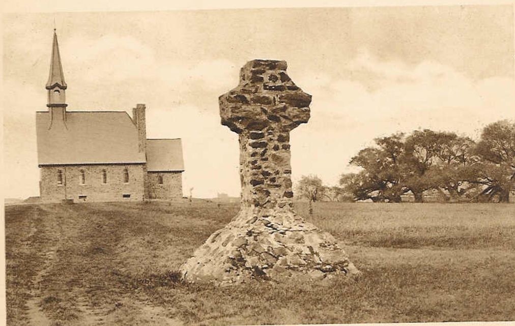
ACADIAN MONUMENT, CHURCH & WILLOWS, GRAND PRE, N.S.

FARTHER DOWN, ON THE SLOPE OF THE HILL, WAS THE WELL WITH ITS MOSS GROWN BUCKET, FASTENED WITH IRON AND NEAR IT A TROUGH FOR THE HORSES.