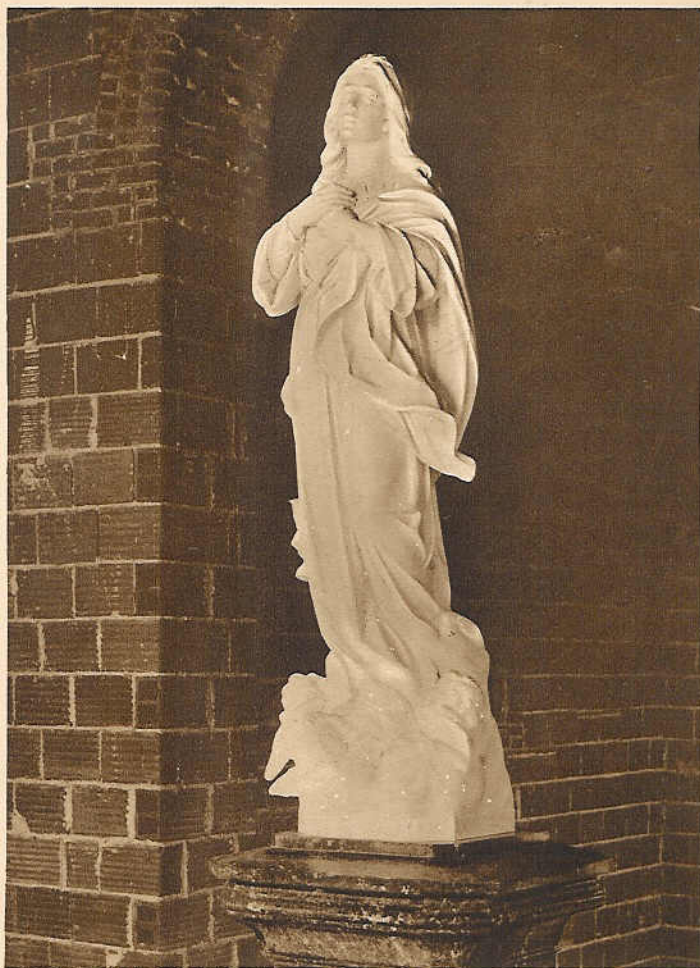
MADONNA STATUE IN MEMORIAL CHURCH, GRAND PRE, N.S.