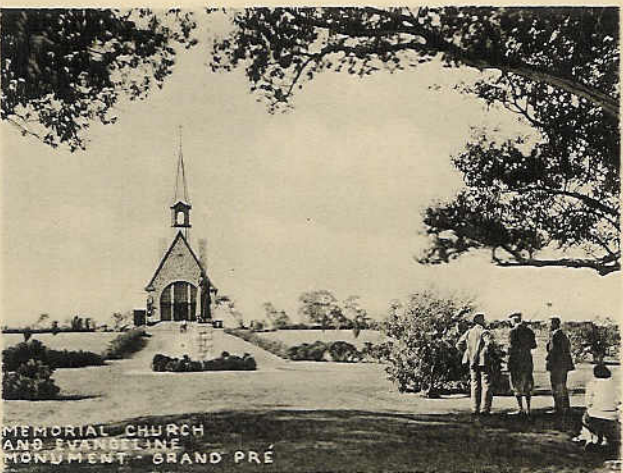
MEMORIAL CHURCH AND EVANGELINE MONUMENT - GRAND PRÉ