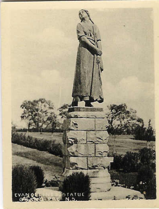
EVANGELINE STATUE GRAND PRÉ, N.S.