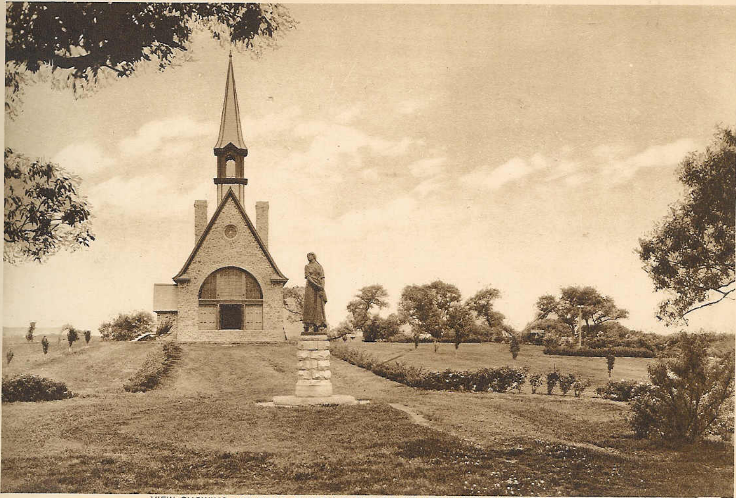
VIEW SHOWING MEMORIAL CHURCH & EVANGELINE MONUMENT, GRAND PRÉ, N.S. IN THE ACADIAN LAND, ON THE SHORES OF THE BASIN OF MINAS. DISTANT, SECLUDED, STILL, THE LITTLE VILLAGE OF GRAND PRÉ LAYS IN THE FRUITFUL VALLEY.