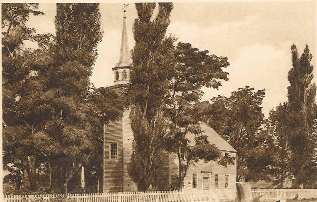
OLD CHURCH, GRAND PRE, N.S., BUILT IN 1805

BASIL THE BLACKSMITH WHO WAS A MIGHTY MAN IN THE VILLAGE AND HONORED OF ALL MEN.