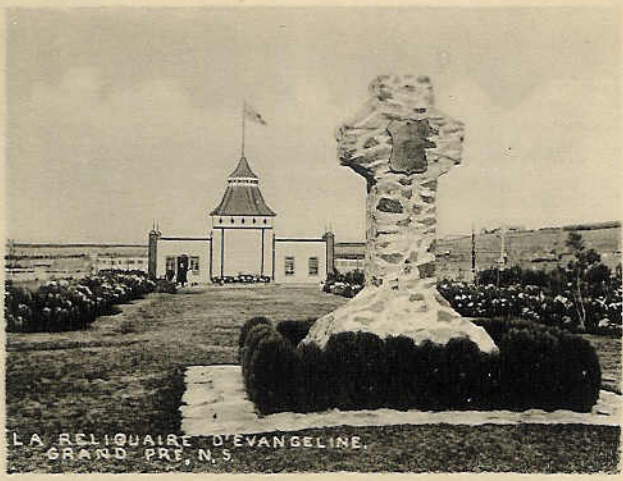
LA RELIQUAIRE D'EVANGELINE GRAND PRÉ, N.S.