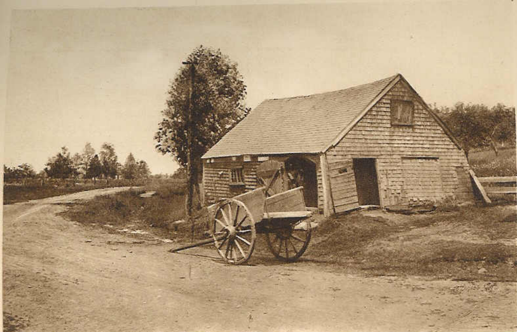
BASIL'S BLACKSMITH SHOP, GRAND PRE, N.S.

BASIL THE BLACKSMITH WHO WAS A MIGHTY MAN IN THE VILLAGE AND HONORED OF ALL MEN.