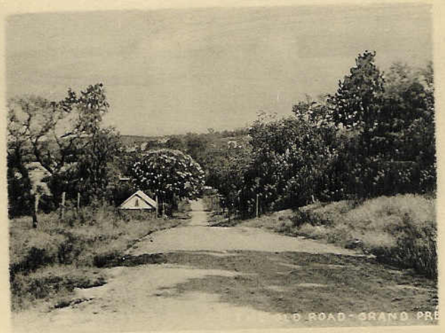
OLD ROAD - GRAND PRÉ