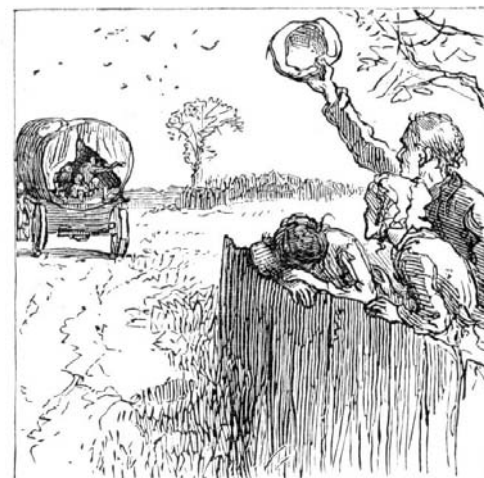
DEPARTURE OF IMMIGRANTS.