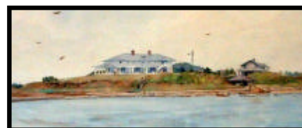
Same photo after one click on Picasa