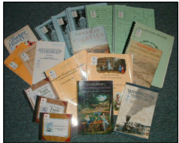
A sampling of the new books and CDs purchased by JCGS