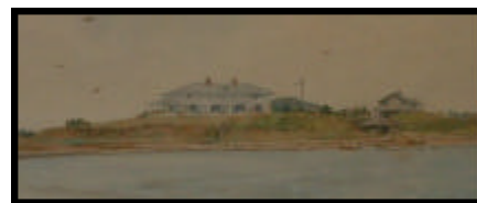
photo of old painting as it looks now

I’ve saved the best news for last...the program is completely FREE! No junky ads, no other unwanted stuff. To download the program just google “Picasa” and follow the directions from there. You can also download a user’s guide.