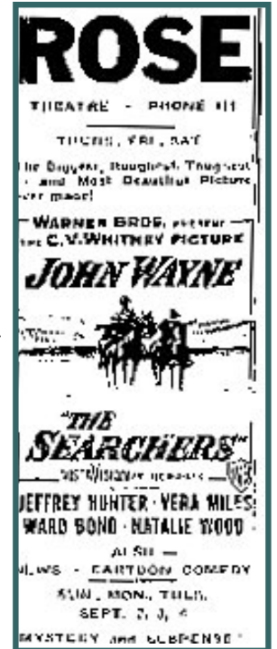
What was showing at the local theater in 1956