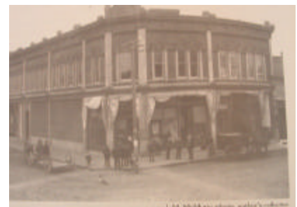
Right— McCurdy Building , Taylor Street around 1887 with Delmonico Restaurant