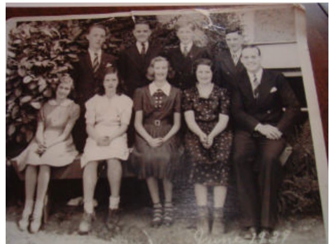
8th Grade Graduation, 1939, Discovery Bay School

So now is the time to decide—where do we want to go from here? Come with your ideas and we will see where they lead us. Looking forward to seeing Round 2!