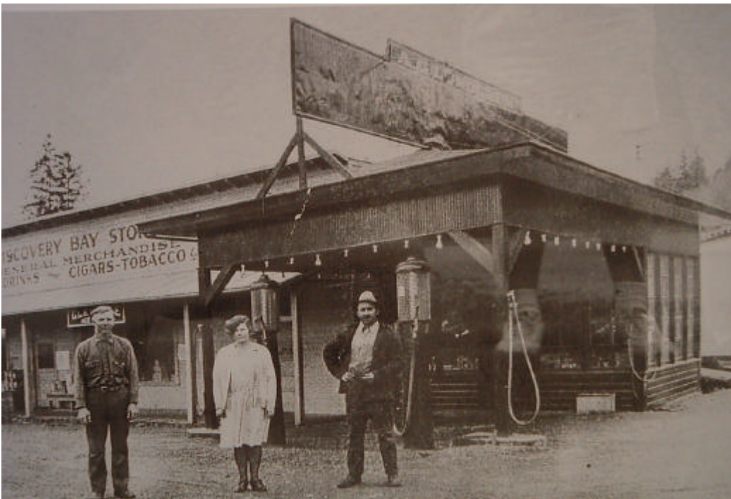
Old Discovery Bay Store around 1920's