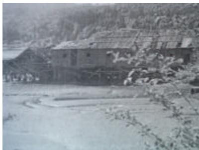
Left—Old Discovery Bay Rail Road Shed