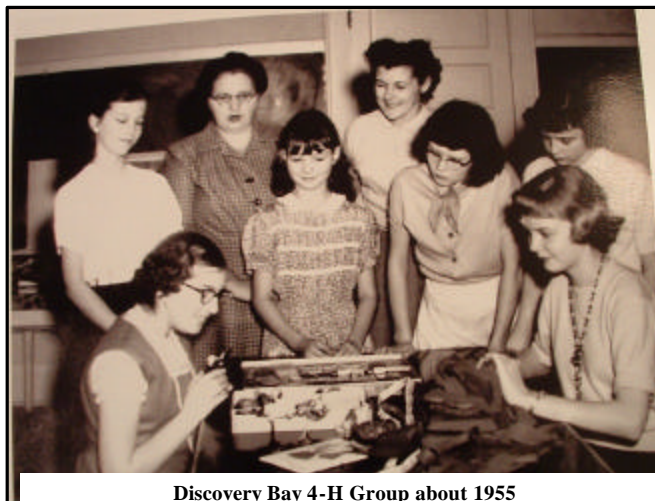
Discovery Bay 4-H Group about 1955