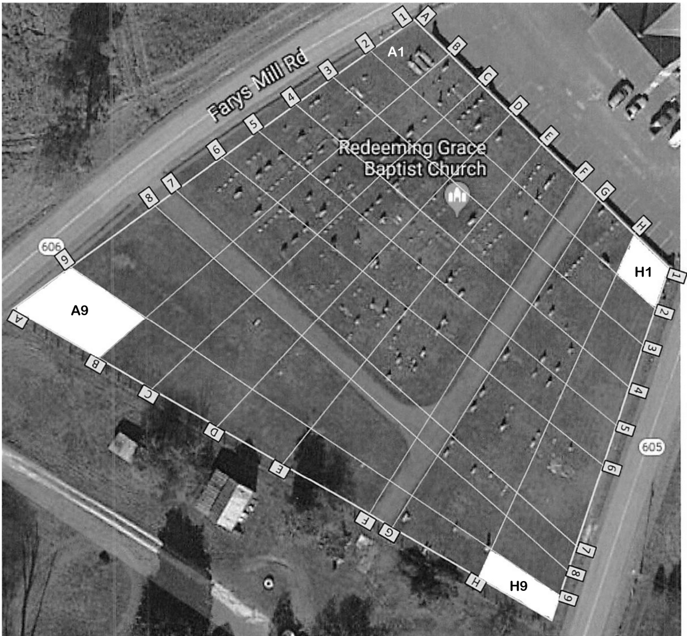
The two-dimensional grid superimposed on an aerial view of the Ebenezer Baptist Church Cemetery used to locate the cemetery markers

Thomas Rilee & Sarah C. Haynes, m. Joshua Steven Dutton.