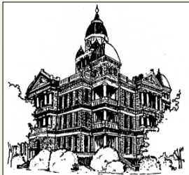
1896- Denton County Courthouse-