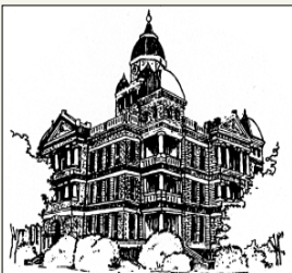
1896- Denton County Courthouse-

The Denton County Genealogical Society meets on the second Thursday during the months on September-November and January-May. 6:30 P.M.