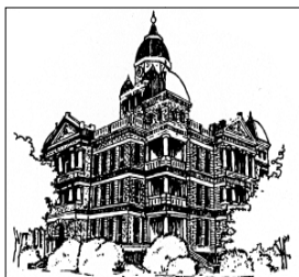
1896- Denton County Courthouse-

The Denton County Genealogical Society meets on the second Thursday during the months on September-November and January-May. 6:30 P.M.