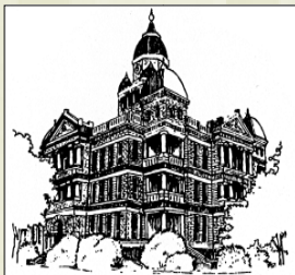
1896- Denton County Courthouse-

The Denton County Genealogical Society meets on the second Thursday during the months on September-November and January-May. 6:30 P.M.