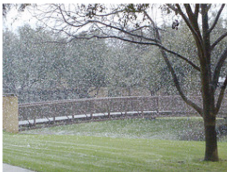
The Beginning of the Blizzard