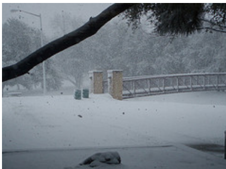
The Park Bridge during the Blizzard