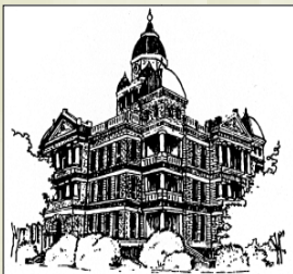
1896- Denton County Courthouse-

The Denton County Genealogical Society meets on the second Thursday during the months on September-November and January-May. 6:30 P.M.