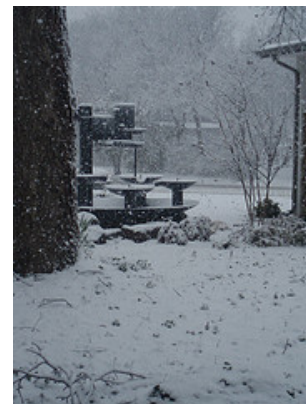
The Library Fountain