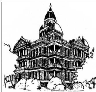
1896- Denton County Courthouse-1996

The location for the November meeting of the Denton County Genealogical Society has changed to the Denton Public Library South Branch, 3228 Teasley Lane, Denton, Texas 76210. The meeting will take place at 7:00 p.m.