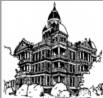
1896- Denton County Courthouse- 1996

THE DENTON COUNTY GENEALOGICAL SOCIETY MEETS ON THE SECOND THURSDAY DURING THE MONTHS OF SEPTEMBER - NOVEMBER AND JANUARY - MAY. 7:00 P.M. LDS CHURCH 3000 OLD NORTH RD. DENTON, TEXAS