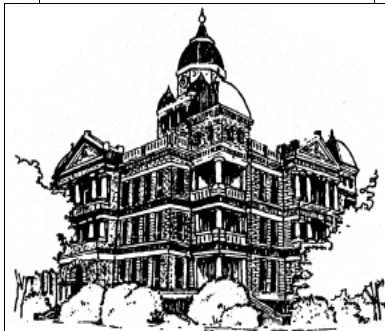
1896- Denton County Courthouse-1996

7:00 P.M. LDS CHURCH 3000 OLD NORTH RD. DENTON, TEXAS