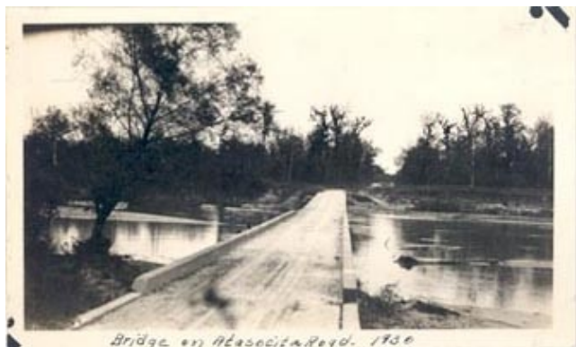
Bridge on Alasocita Road. 1930