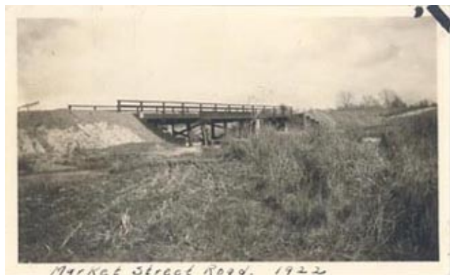
Market Street Road. 1922