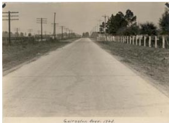
Gilchrist Ave. 1928