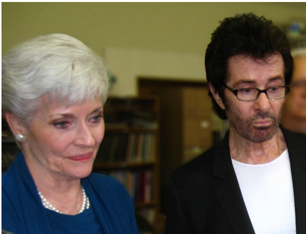
Lee Meriwether and George Chakiris viewing the "Actors of Norwood" slide show.

During a short visit to the Society's room, the visitors saw old photographs of Norwood and a digital slide presentation of actors who came from Norwood. An amusing reaction by Lee Meriwether was when she saw a listing of the TV shows of Norwood's Jack Mullaney . She said, " My ex-husband was on that show! " — the 1966-67 comedy " It's About Time ." The next slide was a photo of Mullaney and his costar Frank Aletter , who was Ms. Meriwether's husband at the time. Mr. Chakiris was surprised when he saw that the late Janice Rule was also a Norwood native.