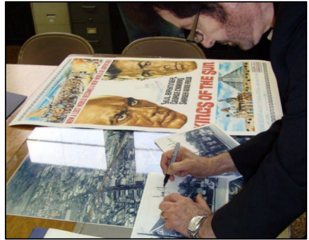
George Chakiris autographing a photograph of his former home/Grecian Gardens at Allison and Sherman

directories, maps of the residences and businesses, photographs and a CD of "Norwood Actors" taken from our "Famous People of Norwood" slide presentation.