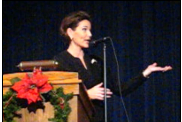
Heather French Henry introducing fellow former Miss America Lee Meriwether