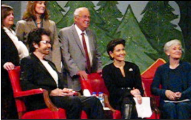
Posing for photos prior to the beginning of the ceremony in the Norwood Middle School auditorium.