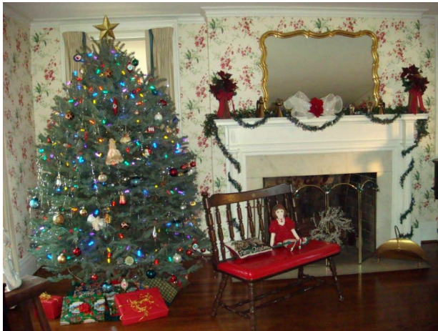
The McCullough Christmas tree donated by the Norwood Historical Society