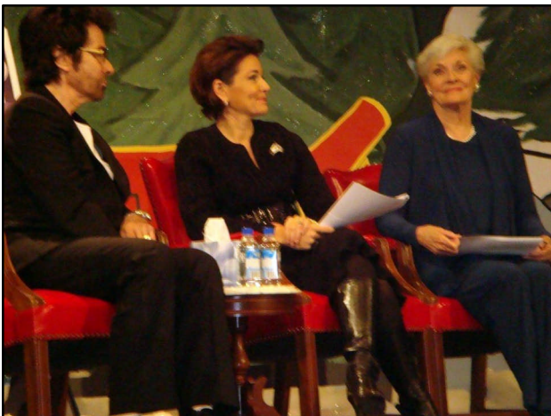
George Chakiris, Heather French Henry and Lee Meriwether on stage in the Norwood Middle School auditorium