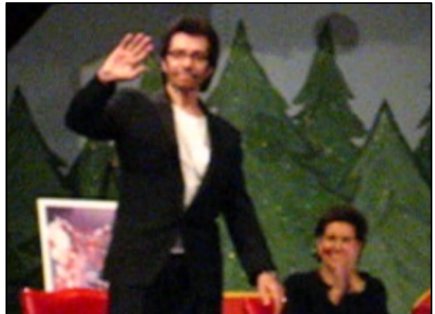
George Chakiris acknowledging the applause of the audience

Mr. Chakiris was asked several questions posed by the students. One with an amusing answer was asked by the Broadway Club: "What story about Norwood and your family is your favorite?" He said he had been told that while his mother was at work, when he was 1½ years old, his five-year-old sister had to dress him in the morning. But he didn't want that and, in his words: "I would get up and I would not be dressed—no clothes on. I would take my clothes and go to my mother where she was working ... to get dressed. So I would go through the streets with no clothes on."