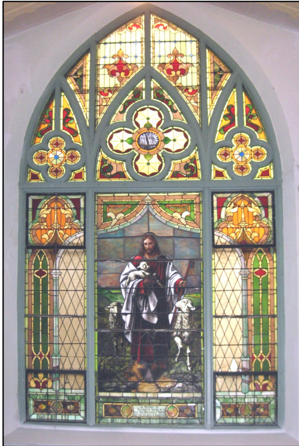
"Smith Window" at Elm St. M.E. Church