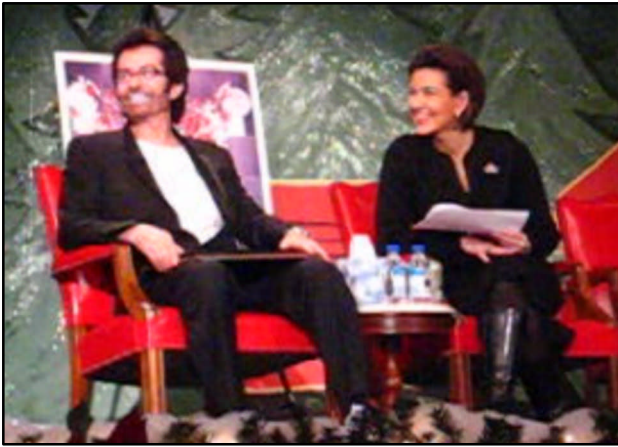
George Chakiris and Heather French Henry laughing at one of Mr. Chakiris' answers to a question posed by the students