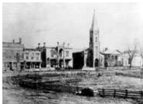
Do you know what these Hudson buildings are?

[These officers were elected at the June 2007 Annual Meeting by members present.]