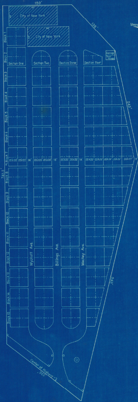
PLAN OF GILBOA RURAL CEMETERY, GILBOA, N.Y.

Hatched areas are plots purchased by New York City in accordance with Sections 2 and 3 of Contract 206. Corners of plots marked with N.Y.C. concrete monuments. References - Acc. X.R.S. B.C.T. and warranty deed of June 25, 1921, from the Gilboa Rural Cemetery, Incorporated, to New York City. Acc. X.R.S. B.C.T. is a copy of cemetery map referred to in above deed.