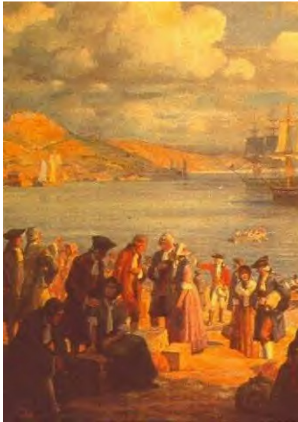
Loyalist Landing at Nova Scotia, Canada, 1783

The Only U.S. Journal Devoted To Loyalist Studies