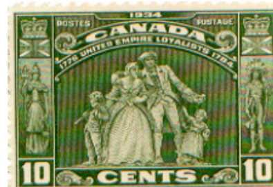
1934 Loyalist 10 cent stamp