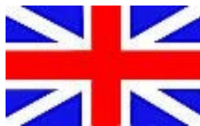
Loyalist Flag (Queen Ann's Flag)

Please pass a copy of this newsletter to your local library or historical or genealogical society. Also, we welcome new members at anytime through the year.