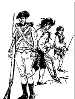
Loyalty Is Everything