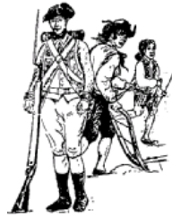
Loyalty is Everything